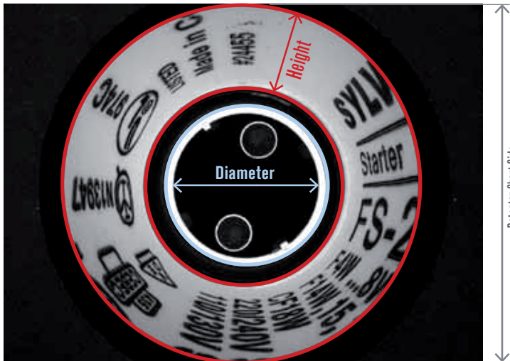
c (%) = Diameter/Detector Short Side